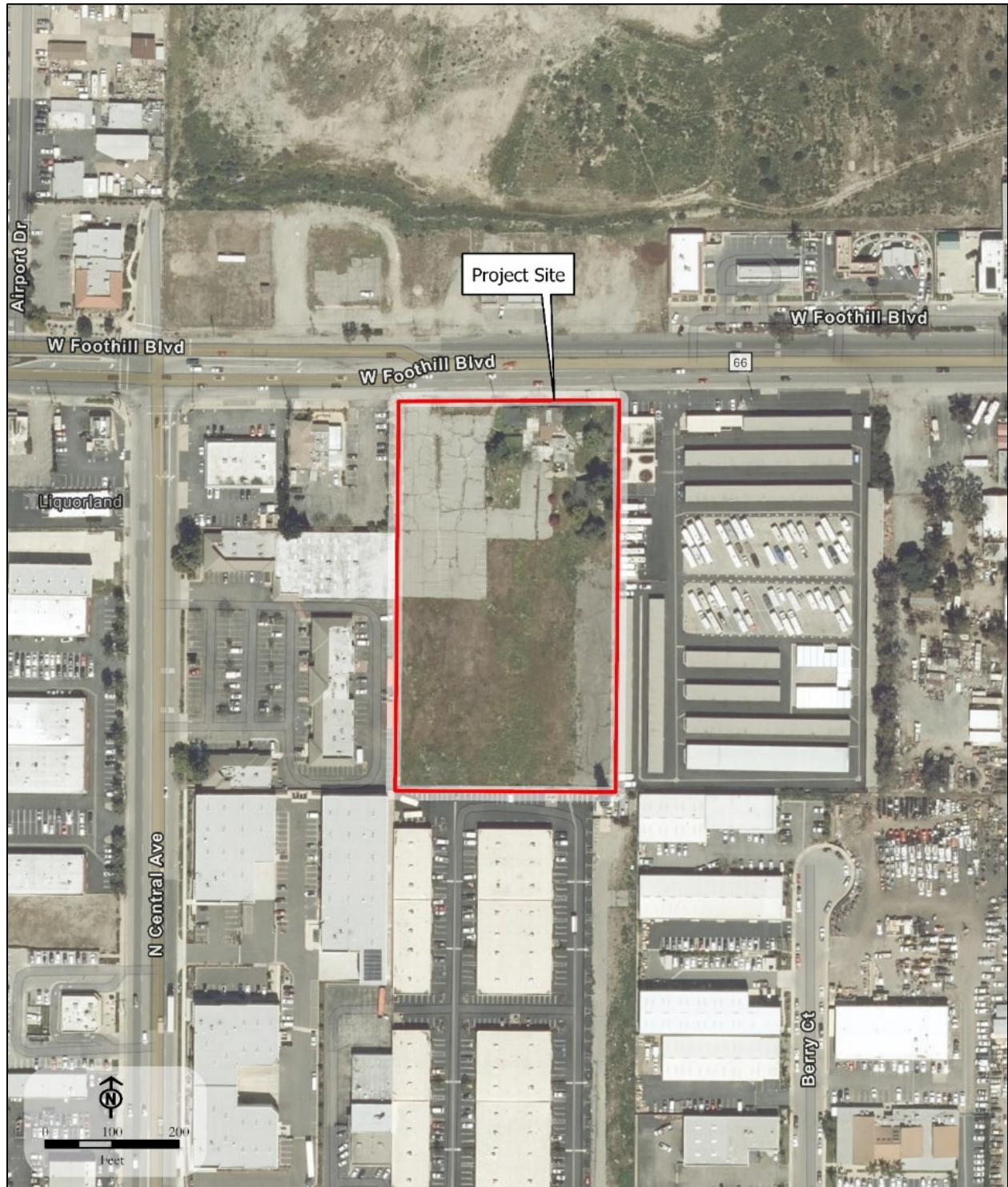
Figure 2 – Aerial Photograph